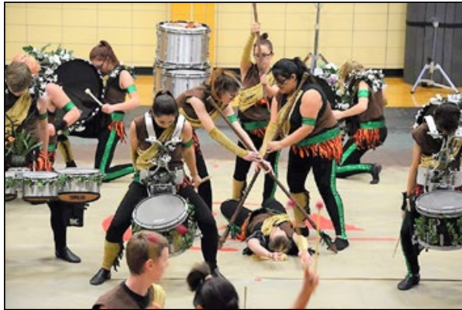
Dramatic finale of the show as the "queen of the tribe" is overthrown and the show ends with the loud thunder of drums and the victorious yell of the triumphant new leader!

The music and marching drill for this show was written by our tech Ian Stowall.