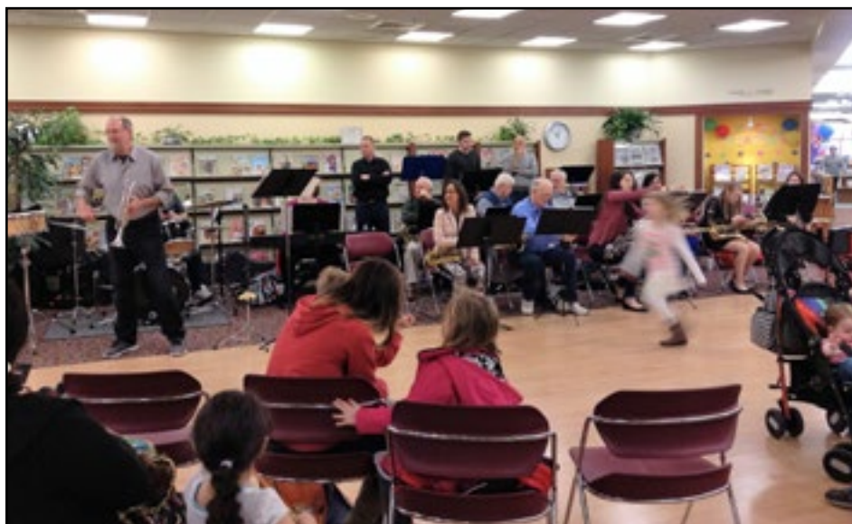
Down by the Dock performs for the crowd at the NCPL Birthday Bash last Saturday.

Over 450 party-goers attended the New Carlisle-Olive Township Public Library's Birthday Bash last Saturday, March 25. The Birthday Bash was part of the library's celebration of its 15-year anniversary at its current location on Bray Street.