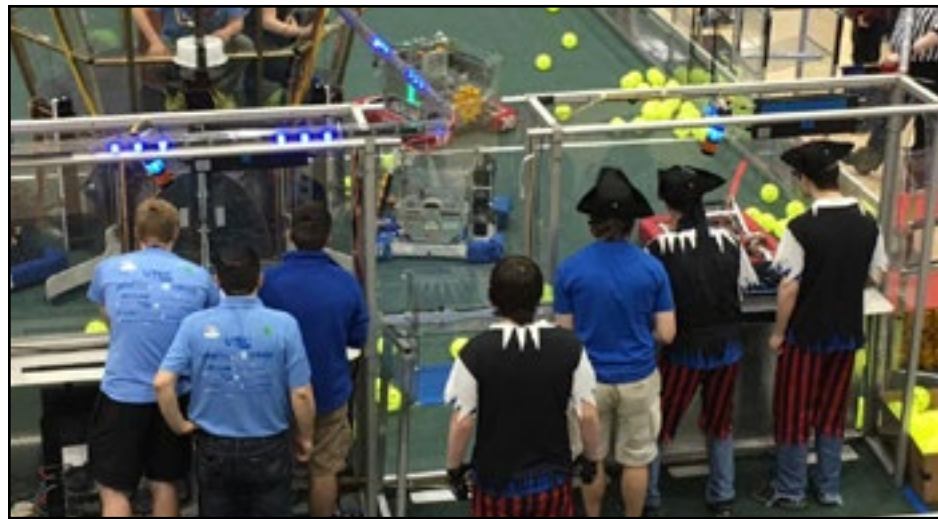
Las Pumas 2197 in action at the FIRST Robotics Competition at Perry Meridian High School

They went on to join two other teams in a winning alli-