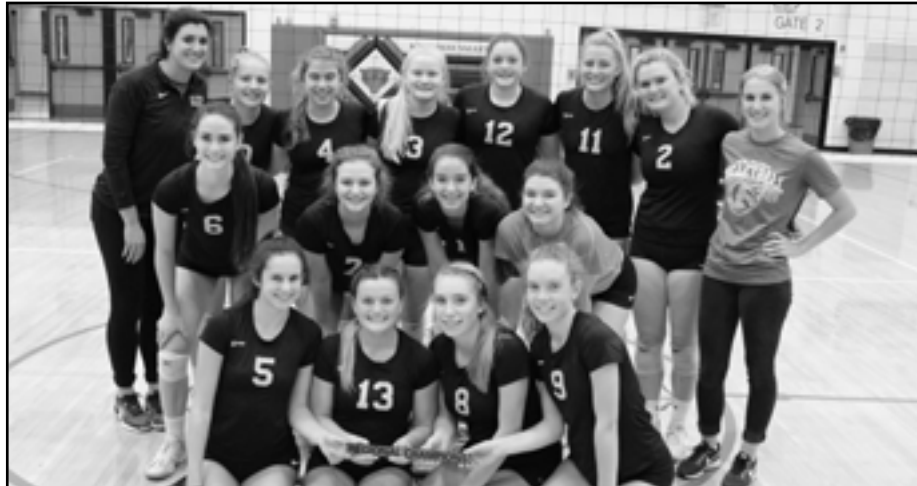
The New Prairie Volleyball team with their Regional Champions plaque, the first for the program since 2015.