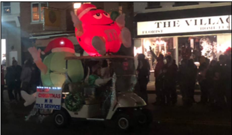
"Red" leads the M&M Tax Service entry, highlighted by the crowd favorite M&M Train.