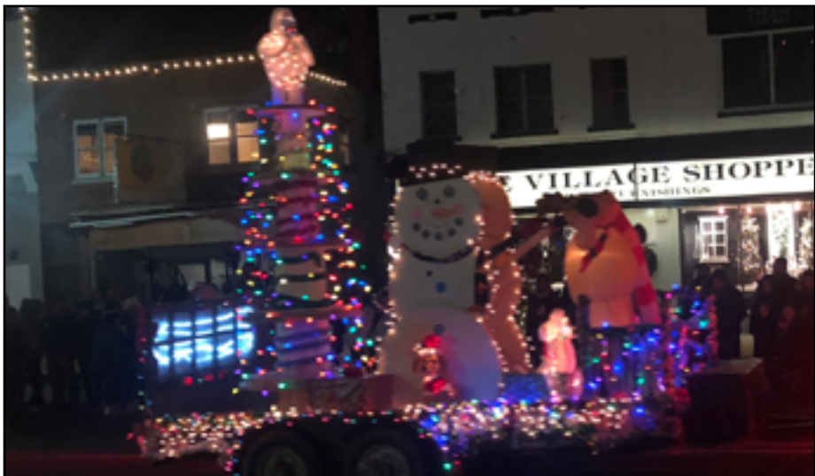
Carris Reels of New Carlisle entered the parade with an even brighter float than last year!