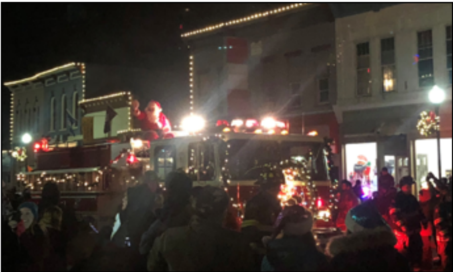
Santa Claus lights up the Town Tree to officially kick off the Christmas season in New Carlisle.