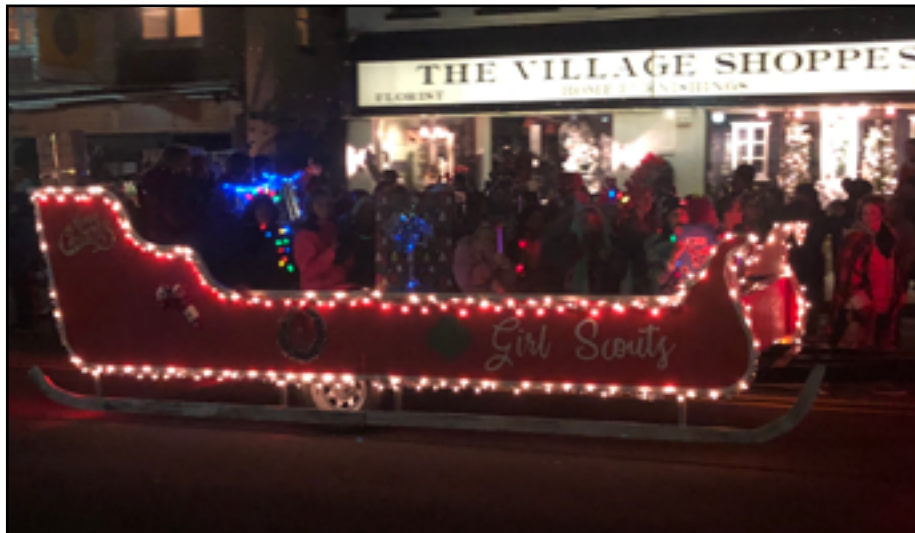
The Girl Scouts creatively converted their trailer into a giant sleigh.