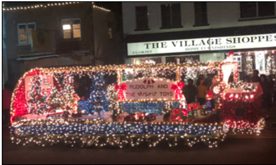
"Grandma and Grandpa Build a Float" once again stood out as one of the best entries in the 42 unit parade.