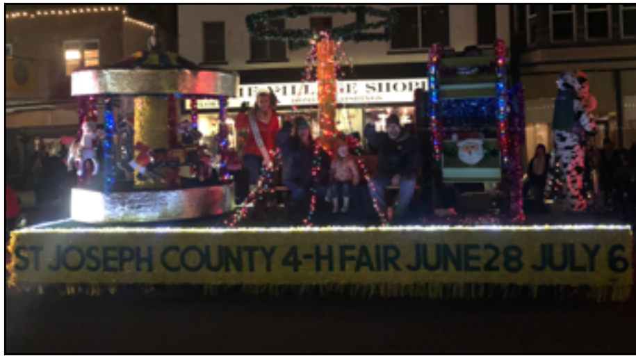
The St. Joseph County 4-H Fair float appropriately featured a carousel and ferris wheel.