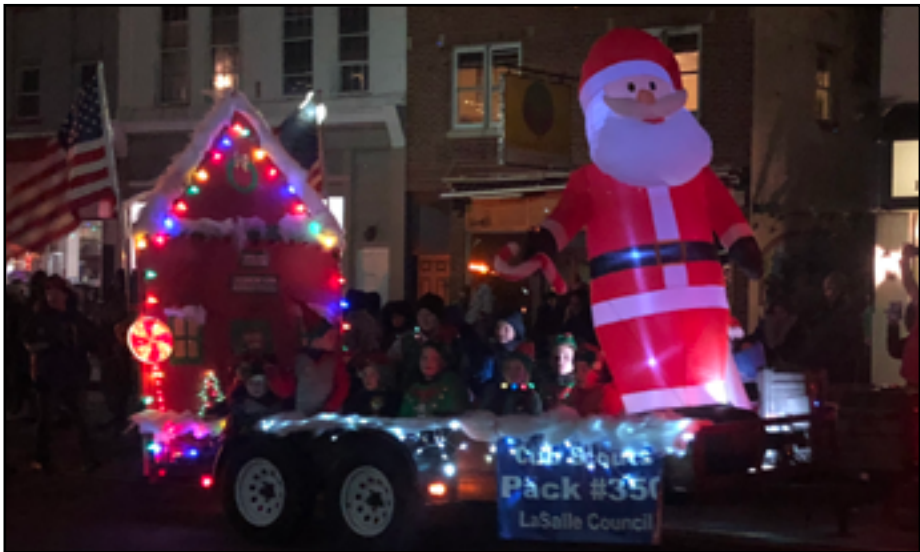
Cub Scouts Pack #350 LaSalle Council proudly flies the Stars and Stripes from their gingerbread house.