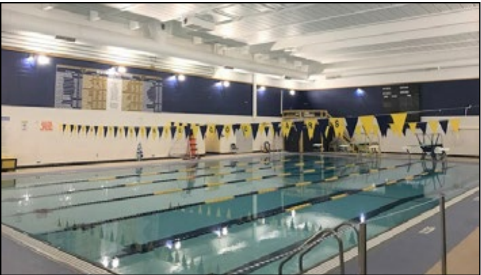
Renovation of the high school pool/natatorium was completed in Fall 2016 to accommodate school swim season this winter.