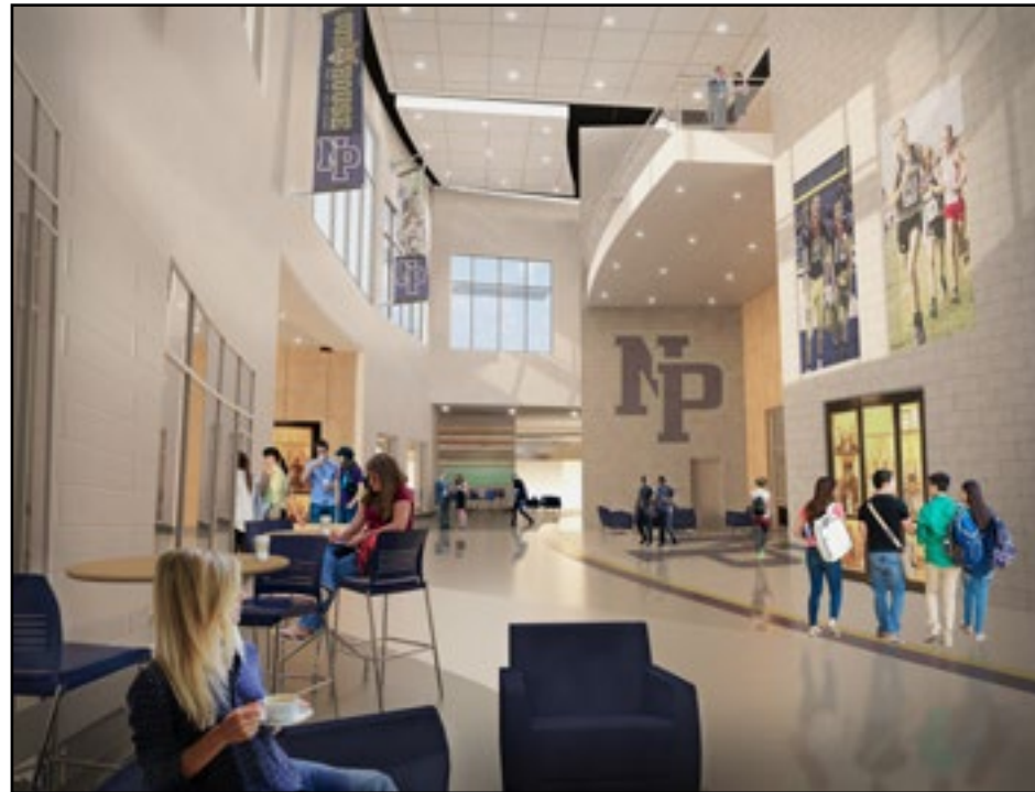
Artist's rendering of the "Hall of Excellence," which will connect the east and west wings of New Prairie High School.