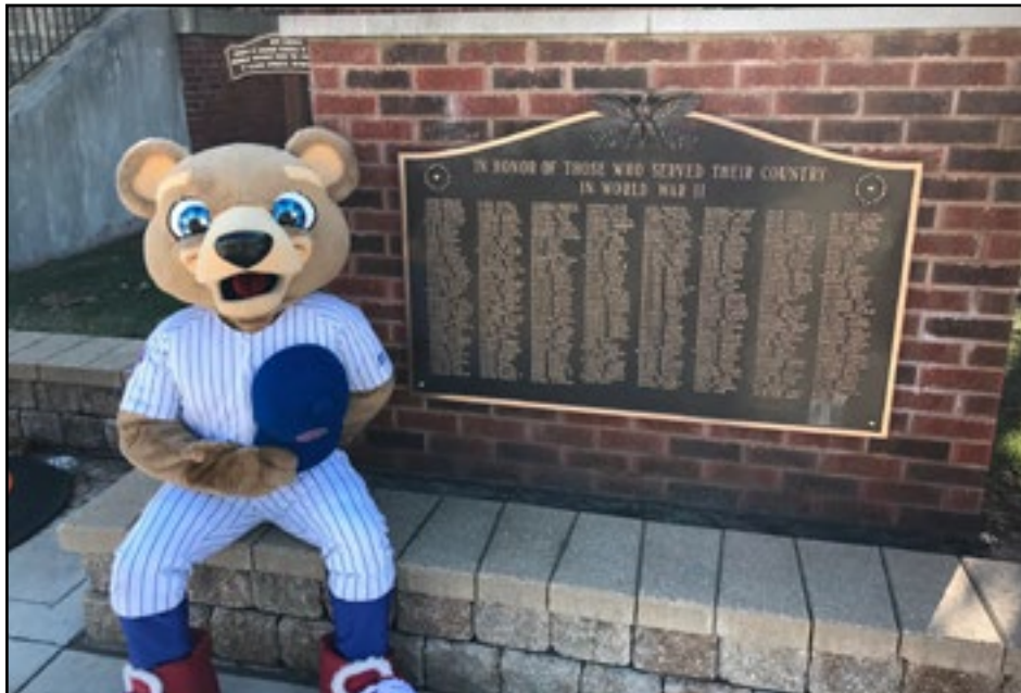
South Bend Cubs mascot Stu made an appearance in New Carlisle on Monday, February 13, stopping by the Town Hall to take a picture with the World War II memorial (above) and the town clock (right).

There was another bear sighting in New Carlisle last week. Unlike the wild black bear which was spotted in the area a few years ago, this time around it was just a friendly "cubbie" bear roaming downtown.