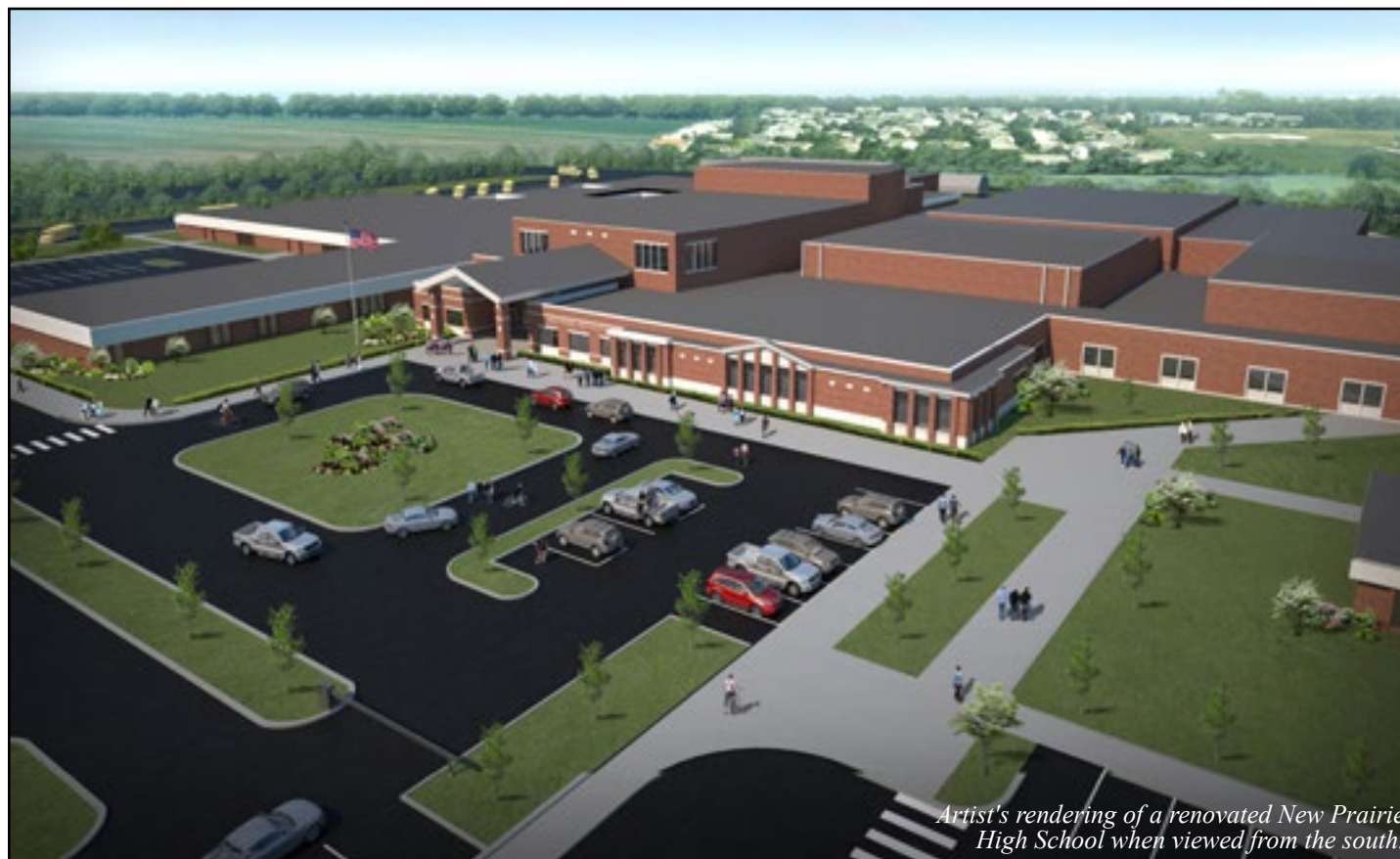
Artist's rendering of a renovated New Prairie High School when viewed from the south.

NPUSC finalizes renovation project plans. See actual tax impact and construction timeline, pages 6-7.