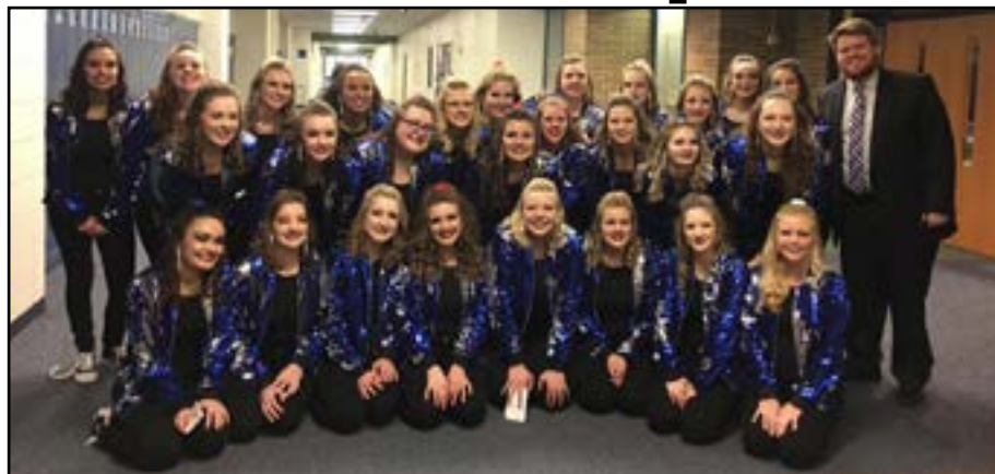
New Prairie Choir: Sing Sensation

Sing Sensation qualified for State Competition by having one of the best 10 scores at a competition in the state. They placed fifth in the State, and we also got best backup band!