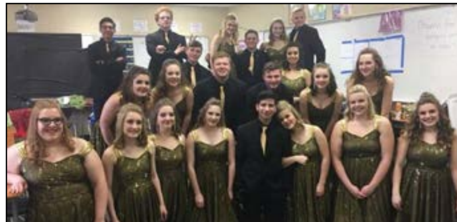
New Prairie Choir: Innovation